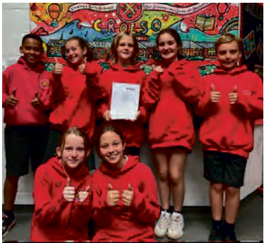
Pupils from Pentrepoeth Primary School

And Estyn said St Woolos Primary “is an effective and caring school, which holds the community it serves at the heart of all it does. Pupil well-being is a strength of the school.”