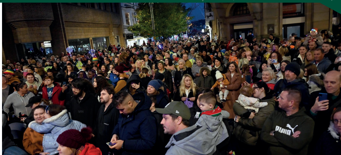
Photos from last year's event

For more details about the event and other festive activities in the city, as well as useful information about services over the holiday period, visit newport.gov.uk/christmas