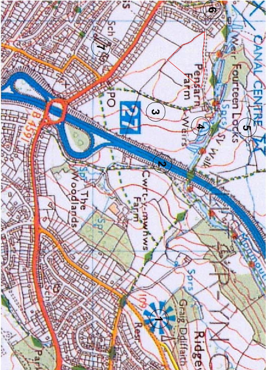
Ordnance Survey Extract Scale 1:10000