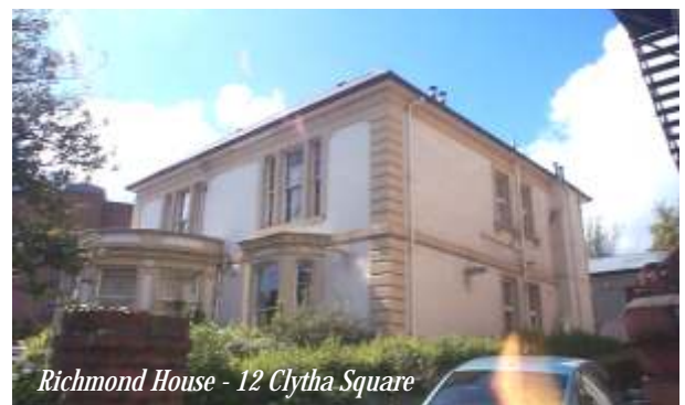
Richmond House - 12 Clytha Square

to the existing use of a roofspace, small flush-set conservation-type rooflights should be installed on secondary roof slopes. The repair and reinstatement of slate roof covering and chimney stacks is encouraged and eligible for grant assistance. The demolition of chimney stacks considerably detracts from the character of the conservation area and should not be entertained. It is recommended that the Council's Conservation Officer is consulted prior to any external works being undertaken to ensure that no statutory consent is required.