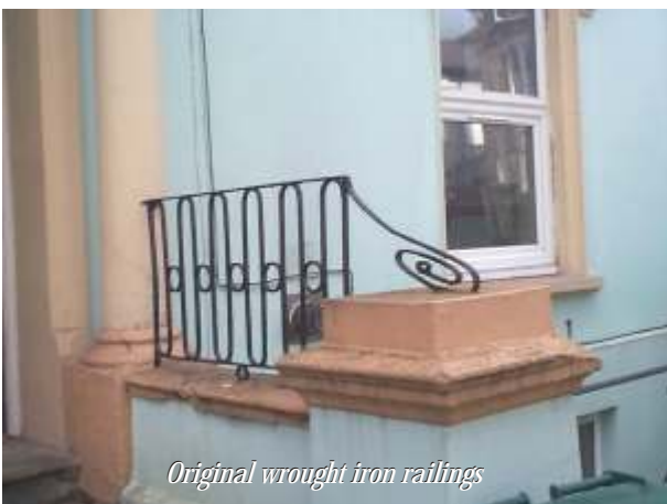
Original wrought iron railings

Boundary walls and railings are part of the cherished streetscene and should always be retained and repaired. Within the conservation area is a variety of different walling; including exposed natural stonework, stucco and buff brickwork. Decorative cast and wrought iron railings add a distinctive element within the streetscene. The repair or reinstatement of railings and boundary walling may be eligible for grant assistance from the County Borough.