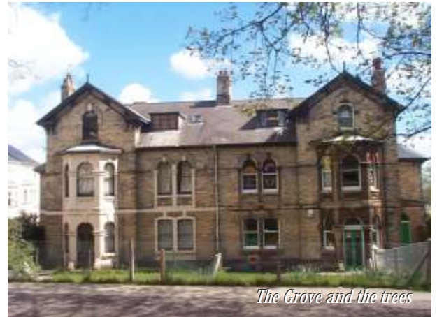
The Grove and the trees

the Square in the later Victorian period. These properties do provide a useful screen to the rear elevations of the Cardiff Road frontage and have largely escaped external alteration.