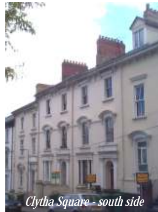
Clytha Square - south side

The consistent use of natural slate roofing serves to unify the conservation area. The roofscape is punctuated by substantial multiple-flued chimney stacks with a variety of pots. On the southern side of the Square are a series of