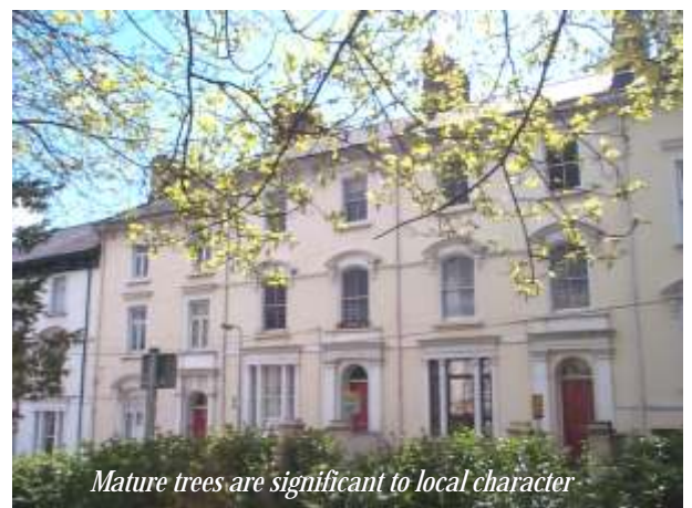
Mature trees are significant to local character

It is not simply the buildings themselves which contribute towards the special historic character of the conservation area, but also the spaces between them. In this instance the formally composed street frontages enclose important predominantly linear spaces in the public realm. These spaces are significantly enhanced by mature deciduous street trees which provide a counterpoint to the formality of the built frontages by their irregular nebulous form.