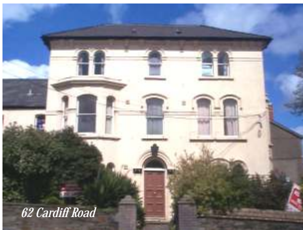
62 Cardiff Road

The linear space separating the Crescent and Square is occupied by the busy principal route way of Cardiff Road. The Road is broad with a central pedestrian refuge and acts as a significant barrier between the two elements of