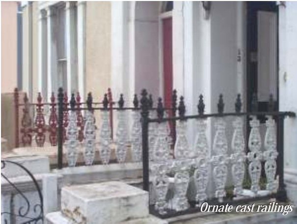
Ornate cast railings