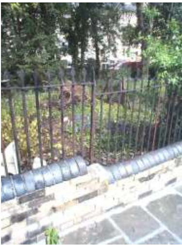
Simple spiked wrought iron railings

Boundary walls and railings are part of the cherished streetscene and should always be retained and repaired. Within the conservation area is a variety of different walling; including exposed natural stonework, stucco and buff brickwork. Decorative cast and wrought iron railings add a distinctive element within the streetscene. The repair or reinstatement of railings and boundary walling may be eligible for grant assistance from the County Borough.