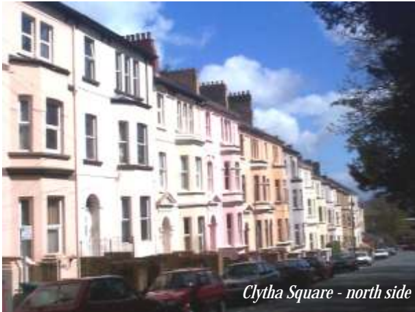
Clytha Square - north side

mid-nineteenth century, three-storey housing, (enclosing the eastern end of the Square) similarly retain raised architraves, platbands and bracketed eaves. In contrast to the southern terrace, these properties have canted bays extending to second floor level, with parapet detail. Window and door openings are emphasised by the use of projecting reeded, flat and segmental hood details.