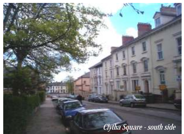
Clytha Square - south side

The use of distinctive render detailing unifies the various frontages within the conservation area and illustrates the