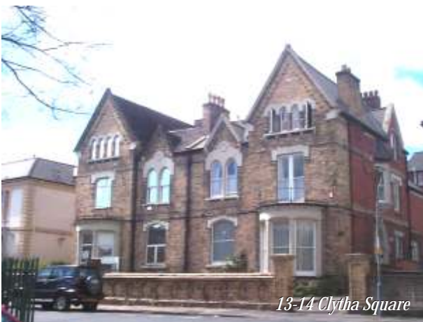
13-14 Clytha Square

Whilst the Square is dominated and defined in character by the classically-derived, stuccoed Italianate Victorian terracing on the north and south sides, the stylistic transition in the later Victorian period towards Gothic and Freestyle is manifested at the western end of the Square. Numbers 13-14 comprise a pair of yellow brick villas in a Gothic derived idiom with Bathstone window surrounds and steeply pitched gabled roofs. Whilst adjacent to this pair is number 12, the finest detached Italianate villa in the Square. Both developments were complete by 1876. This property has suffered from the removal of the eaves brackets and chimney stacks. At the eastern end of the Square to the rear of properties fronting Cardiff Road a semi-detached pair of late Victorian, weakly Italianate brick villas have been introduced. These properties are not indicated as plots on the 1876 plan, instead their plots form part of the sylvan glade planting at the centre of the square. Whilst the infilling of this important space is regrettable, such development may illustrate the declining social status of