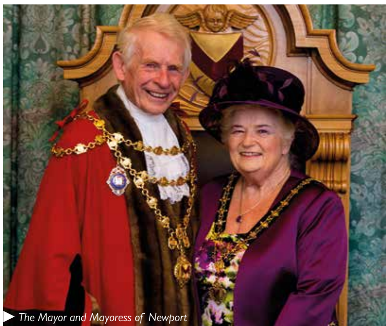
The Mayor and Mayoress of Newport

Full details of all portfolios are available at www.newport.gov.uk