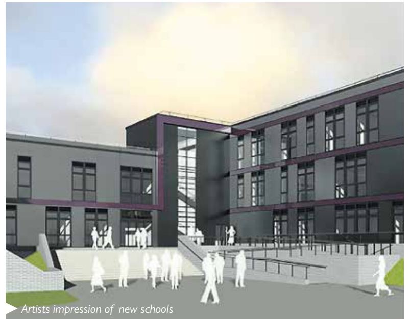
Artists impression of new schools